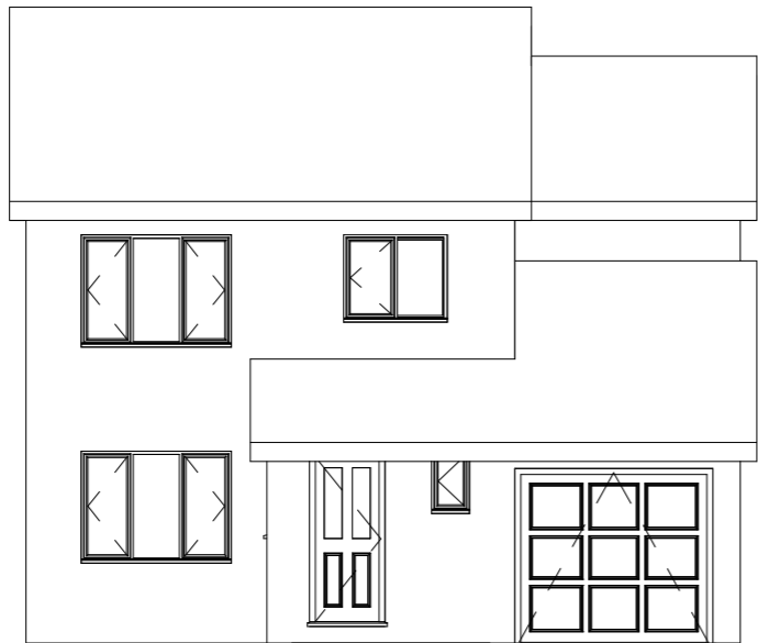
1 Existing south 1 : 100